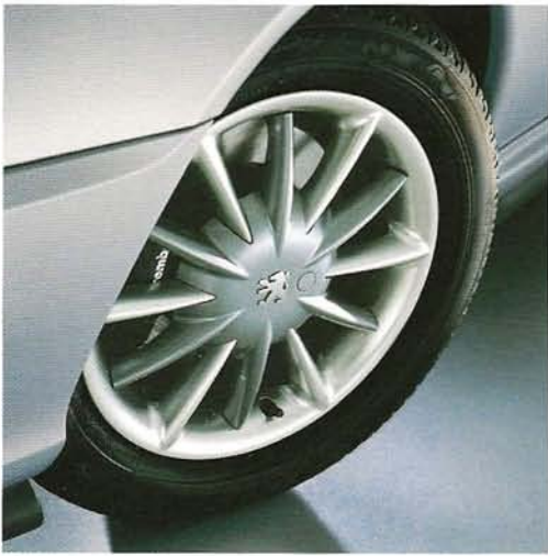
Striking new Nautilus alloy wheels