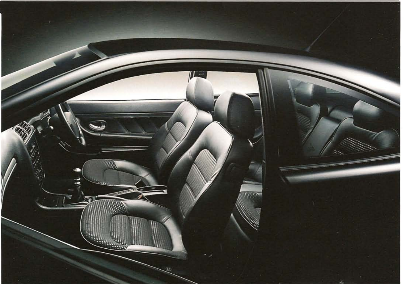
Luxurious interior with unique Chess trim

The Coupé carries the prestigious Pininfarina badge